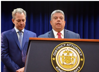
With NYS Attorney General Eric Schneiderman

In addition, the Total Index Crime in Brooklyn (representing the seven major felony crimes) was down 5% in 2017 compared to the year before, with decreases in all categories except for reported rapes (19 additional incidents). The number of arrests in the borough was down by over 7,200 (an 8.4% drop) for a total of less than 80,000.