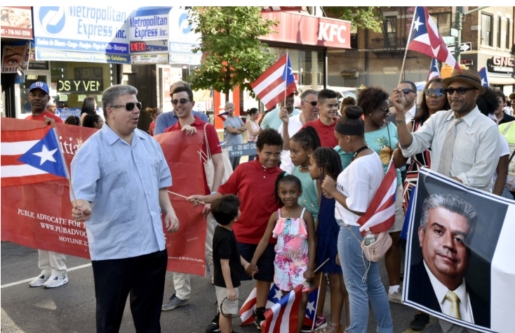
Marching with Public Advocate Tish James and others at the Brooklyn Puerto Rican Day Parade