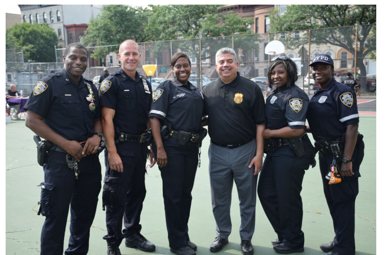
With police officers during National Night Out Against Crime