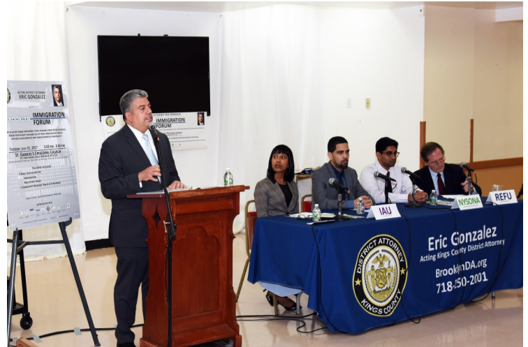
Speaking at an Immigration Forum at Bet El-Maqdis Islamic Center of Bay Ridge