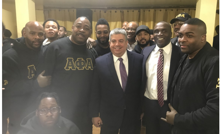
With members of Alpha Phi Alpha Fraternity at their Day of Service during Martin Luther King Day