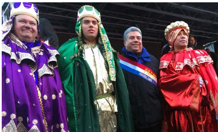
As Padrino of the Brooklyn Three Kings Day Parade