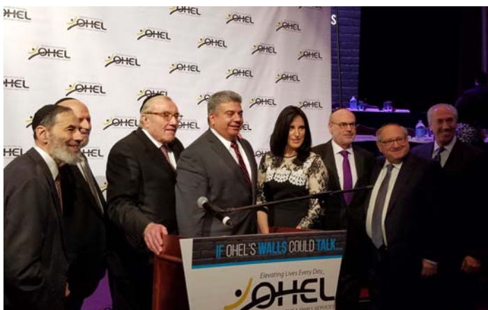
Celebrating at the 47th Annual Gala of OHEL, an organization that provides family services and support