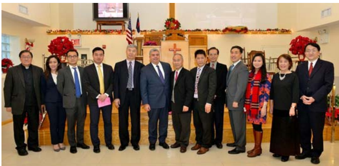
Joining the Chinese Promise Baptist Church for its Christmas Music Worship Meeting