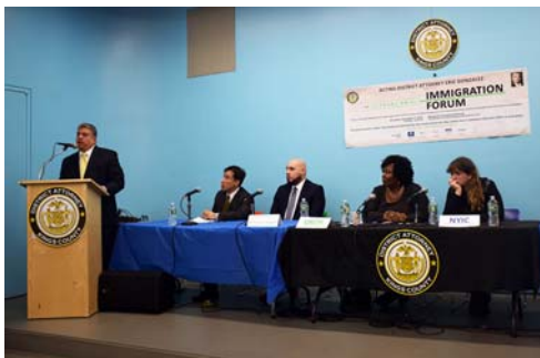
Acting DA Gonzalez at the Brooklyn Immigration Forum in December

In December, the Office held its second Brooklyn Immigration Forum of the year, giving immigrants — regardless of their