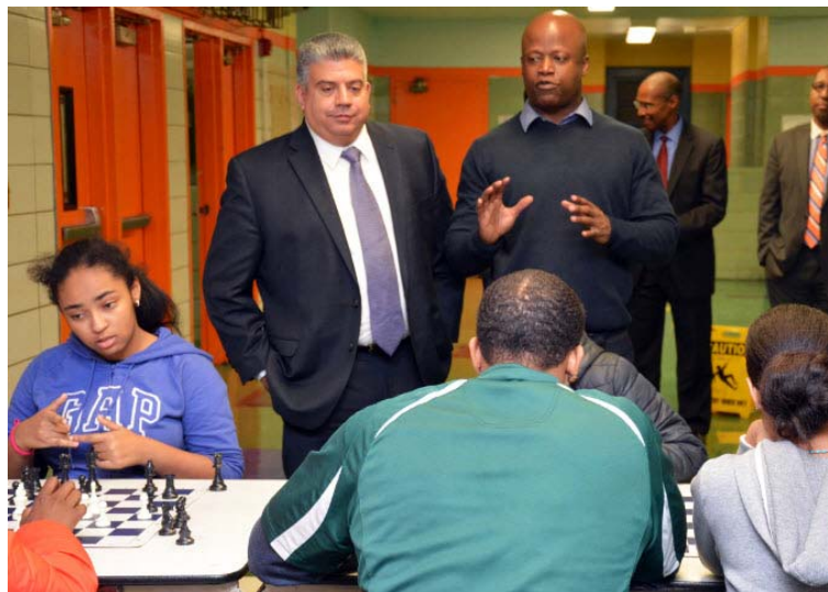
With Grandmaster Maurice Ashley at launch of a chess program for students with the Police Athletic League