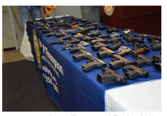
Investigation by DA Thompson's Office found 153 firearms that were smuggled aboard Delta flights

The case is a shining example of how a local law enforcement objective - in this case ending gun violence in Brooklyn by stopping illegal smugglers - can have policy ramifications that improve the safety of all Americans.