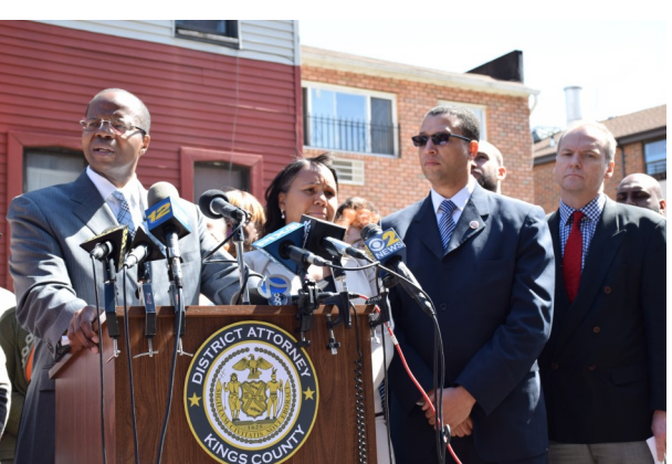
DA Thompson announces the arrest of dishonest landlords in Bushwick

They also affirmed the DA's determination to prevent any unlawful abuse of Brooklyn's lucrative real estate market.