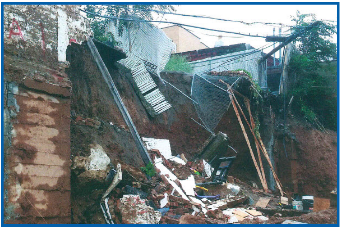
Aftermath of wall collapse

Furthermore, in the days before the collapse, it is alleged that two of the defendants were informed by several workers of potentially dangerous conditions, including that the rear wall was moving forward and needed to be braced with an additional beam. A neighbor who lives immediately adjacent to the rear wall also told the defendants that her patio and garage had caved in. Despite those warnings, the defendants allegedly refused to direct the workers to install additional bracing or halt work at the site to assess or remedy the conditions.