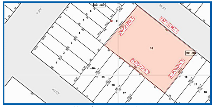
Map of construction site

Despite repeated warnings of dangerous conditions at the site — where workers were performing demolition, excavation and foundation work to erect a four-story manufacturing facility and underground garage — it is alleged that the owner of the excavation company refused to stop work or take additional safety precautions. On September 12, 2018, disaster struck when a portion of the support excavation system and an existing masonry wall collapsed on Sanchez, 47, burying him under thousands of pounds of debris.