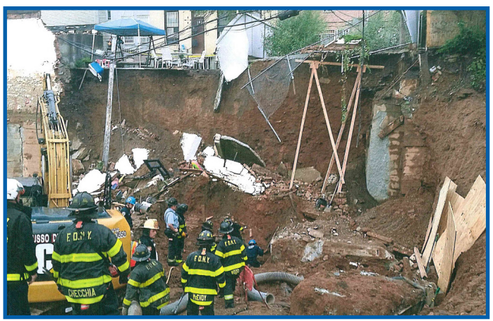
Rescue workers at site of wall collapse

It is alleged that the defendants did not ensure the construction site was compliant with safety regulations established by the DOB and OSHA and that they failed to follow design plans submitted and approved by the DOB. Instead, the defendants allegedly went forward without a plan, leading to a host of safety hazards, including an excessively deep excavation, improper installment of the underpinning system and neglect of safe bracing procedures.