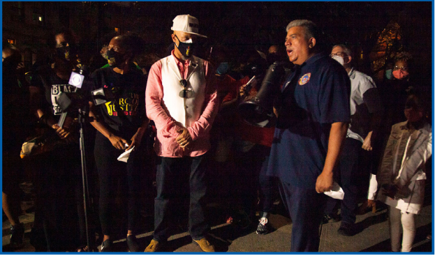
Speaking out against gun violence with mourners at Bed-Stuy's Raymond Bush Playground