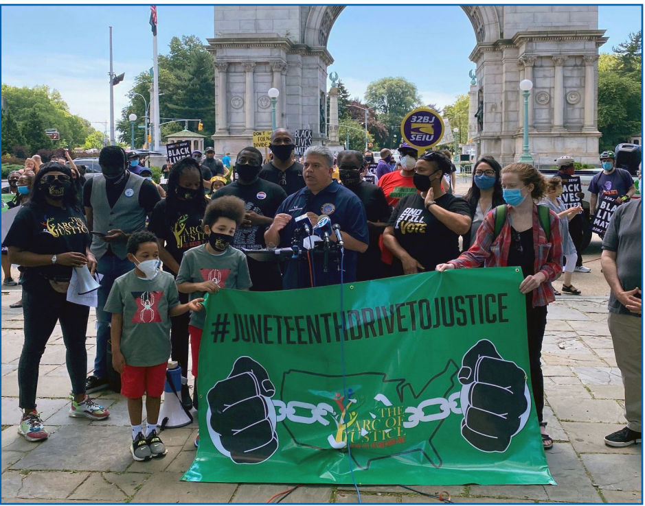
DA Gonzalez standing with community leaders in celebration of Juneteenth and in support of a fairer, more just city

As our fight moves forward, we are inspired by this triumph of good over evil and the magnificent women and men who broke seemingly unbreakable chains of bondage.