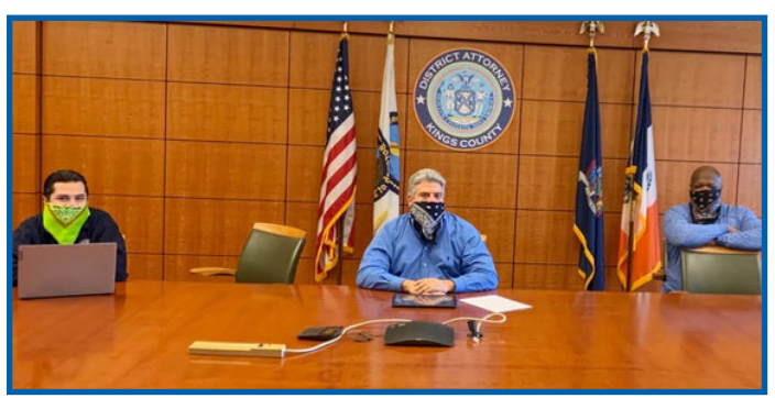
The DA with his COVID Response Team in a meeting at the height of the pandemic.

groups, with participants putting themselves in harm's way to make sure that those in need are served during this crisis.